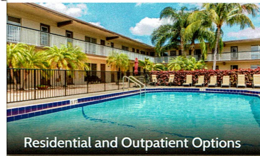
Residential and Outpatient Options

The Florida House Experience, Where People Get Better