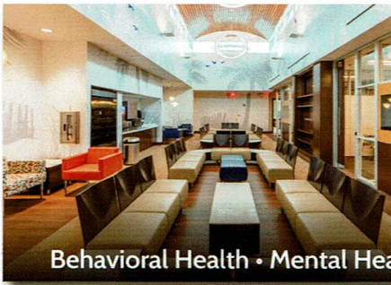
Behavioral Health • Mental Health